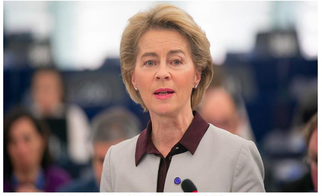
EU Commission President Ursula von der Leyen

Comment: We must not lose sight of the persisting climate and ecological crisis when working out how to spur the economy after the coronavirus pandemic